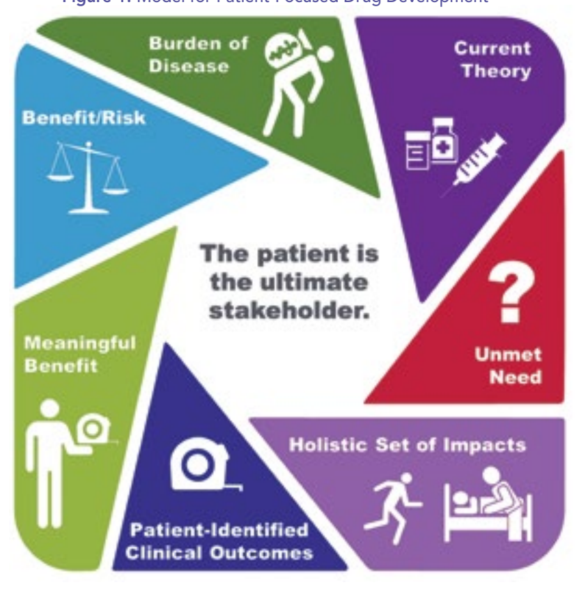
Figure 1. Model for Patient-Focused Drug Development

As described in the FDA's plan, this first guidance is expected to highlight approaches to engaging with patients and collecting patient input throughout the entire drug development process. The proposed scope of this guidance highlights the importance of engaging with patients throughout a product life cycle through patient consultant services, surveys, advisory boards, interviews, and other research activities. This type of evidence may become acceptable information for regulatory submissions, so sponsors starting clinical programs need to consider engaging patients early and often.