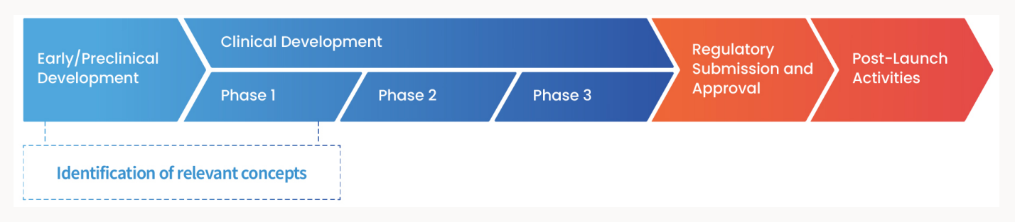
Figure 11. Treatment development lifecycle and when the identification of relevant concepts takes place

The research for the assessment of the suitability of the COA measure and COA measure selection should start as early as possible in the treatment development process and should be finalized before the start of a Phase 2 clinical trial. Ideally, a preliminary COA strategy (identification, implementation, interpretation, and communication of COA in the context of clinical trials) will be tested in Phase 2 and refined after Phase 2. The final COA strategy will be implemented in Phase 3.