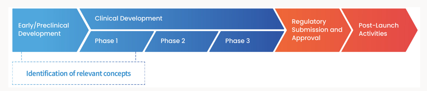
Figure 8. Treatment development lifecycle and when the identification of relevant concepts takes place

The research for the identification of relevant concepts should start as early as possible in the treatment development process and should be finalized before the start of a Phase 2 clinical trial. Ideally, a preliminary COA strategy (e.g., identification, implementation, interpretation, and communication of COA in the context of clinical trials) will be tested in Phase 2 and refined after Phase 2. The final COA strategy will be implemented in Phase 327.