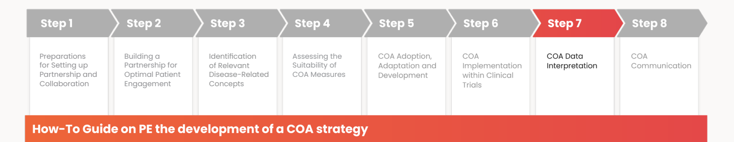
Figure 17. Step 7 of the How-to Guide

To be clinically relevant and supportive for clinical trial filing, a COA endpoint must be defined per protocol as a standalone endpoint among other endpoints to accurately measure the efficacy (and safety) of an intervention. Data analysis by statisticians helps to identify statistically significant changes observed with the new treatment.