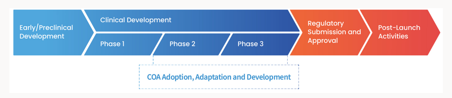
Figure 14. Treatment development lifecycle and when COA Adoption, Adaptation and Development takes place

Given that both approaches - adaptation of an existing or development of a new COA measure require much time, resources, and many level of engagement involving various stakeholders as well as comprehensive psychometric testing research, such efforts should start prior to Phase 2 in order to be able to implement the final version in the Phase 3 studies.