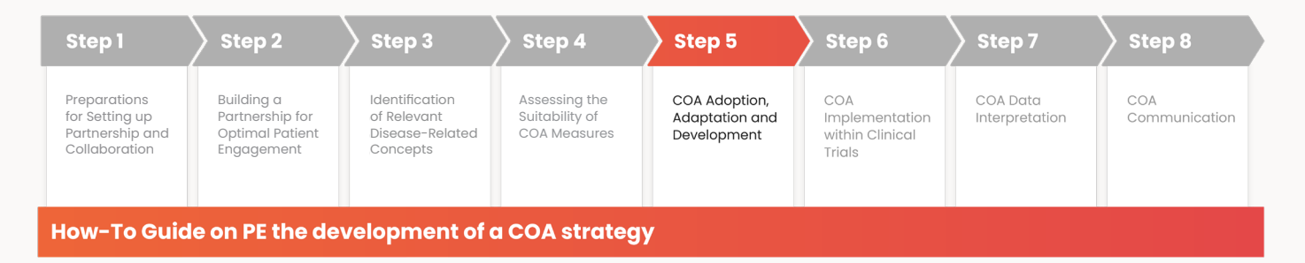
Figure 12. Step 5 of the How-to Guide

If the evaluation done under Steps 3 and 4 reveals that no existing measure meets the selection criteria that are relevant to the target population and context of use, the adaptation of an existing measure or the development of a new measure should be considered. It should be noted, however, that the development of a new COA measure is a complex and time-consuming activity.