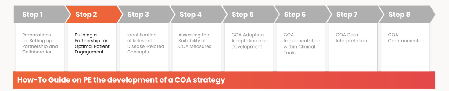
Figure 4. Step 2 of the How-to Guide