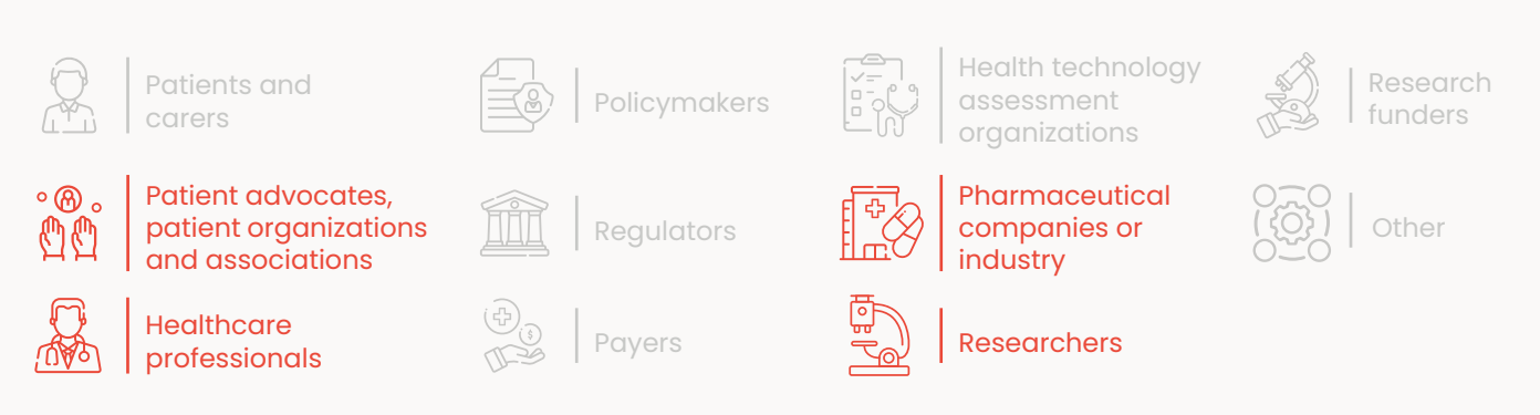
Figure 1. Relevant stakeholders in patient engagement in the development of a Clinical Outcomes Assessment (COA) strategy

This How-to Guide will be of use to all stakeholders eager to begin or continue meaningful patient engagement at all stages of the treatment-development process. This guide has been developed for stakeholders that already have a medium to advanced understanding of COA measures.