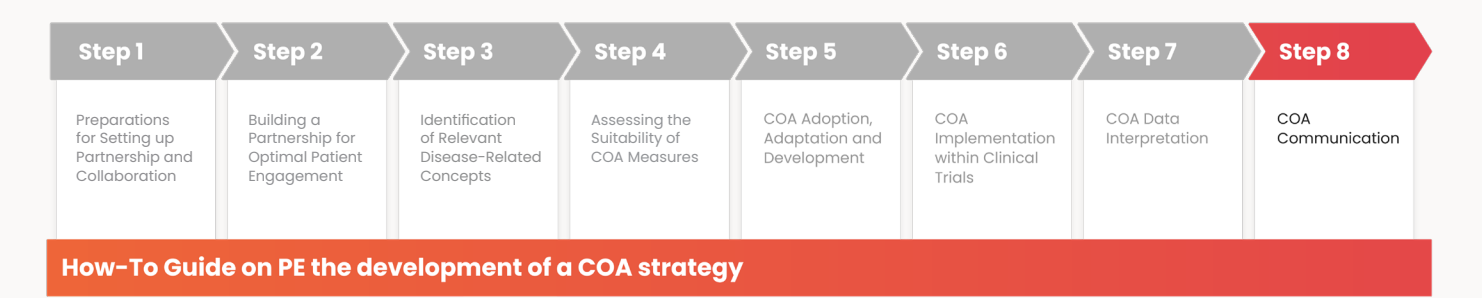
Figure 19. Step 8 of the How-to Guide

Communication of clinical trial results is generally done through product labelling, scientific communication and clinical trial reports<sup>45</sup>. Additionally, improving the clarity and meaningfulness of communications around COA data is critically important so that patients and physicians can understand and use the data collected in the clinical trials to inform their decisions.