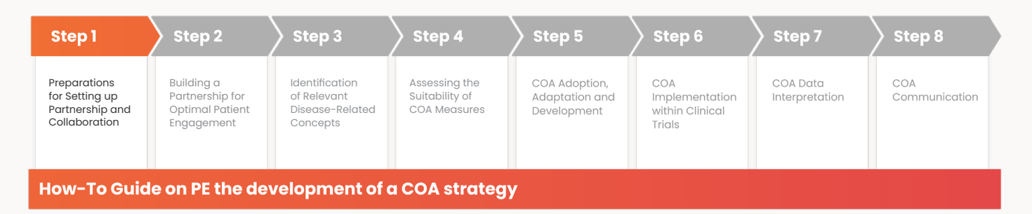
Figure 3. Step 1 of the How-to Guide