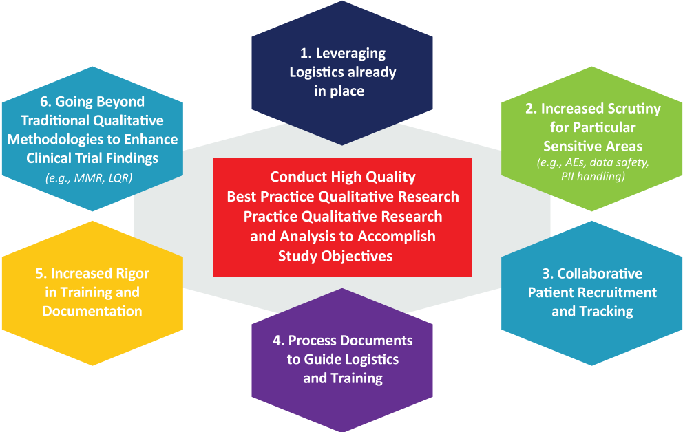
Figure 2: Model for EEI Implementation

Qualitative interviews play a crucial role in capturing patient experiences and perspectives, thereby enhancing the understanding of treatment efficacy and patient-reported outcomes. These interviews offer additional unique benefits when conducted within the context of a clinical trial.